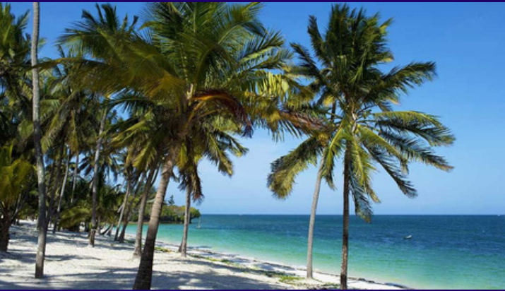
The marvellous Indian Ocean