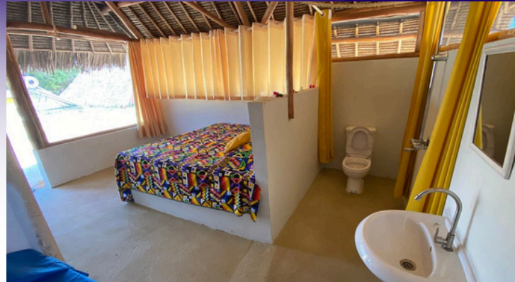
Your Private Home