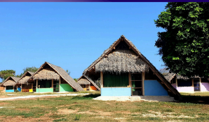
Your African Cabin