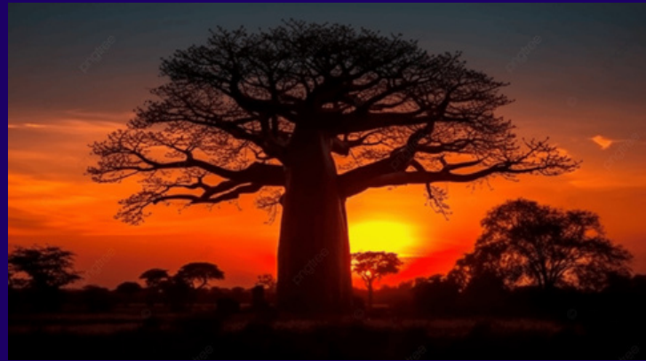
The Sacred Baobab Tree