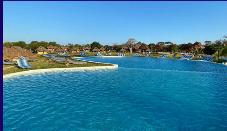
A super clean Swimming Pool